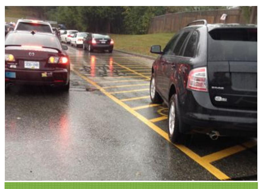
2 Do not park on the ANY of the yellow cross-hatching. The bus needs this area to make the turn.