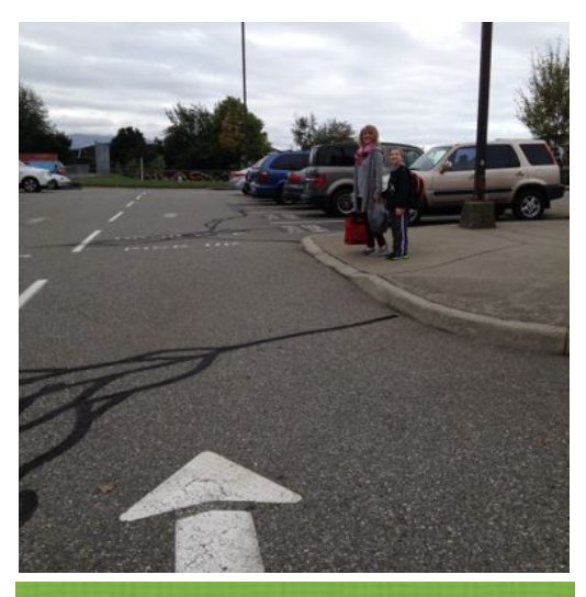
1. Keep our traffic flowing by using the "drop off" zone. No need to park! This area starts at the island and extends south. Pull forward as far as you can.