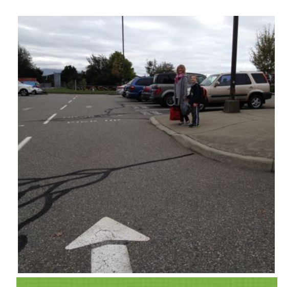
1. Keep our traffic flowing by using the "drop off" zone. No need to park! This area starts at the island and extends south. Pull forward as far as you can.